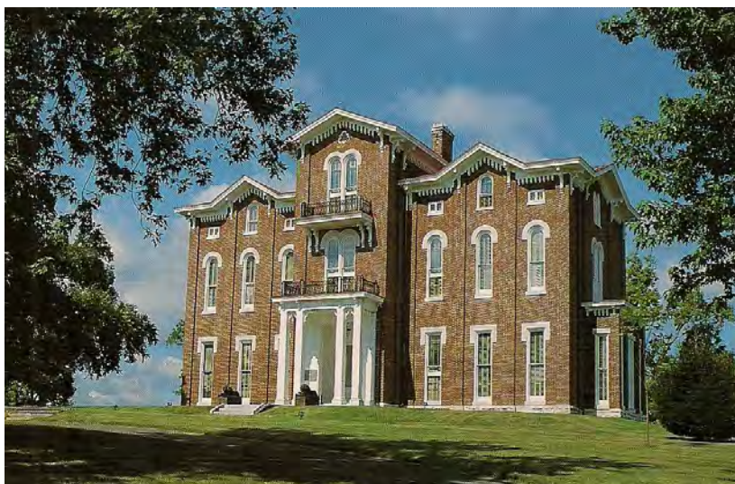
White Hall Home of Cassius Marcellus Clay