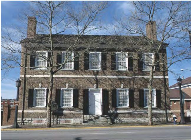
Mary Todd Lincoln House